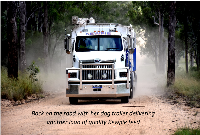
Back on the road with her dog trailer delivering another load of quality Kewpie feed

You can contact us for a quote by e-mail, phone or fax— refer to page 1 for contact details.